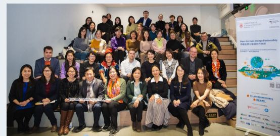
Kick off event of the Women in Green Energy Initiative